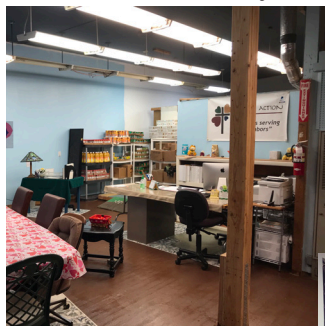
Desks & Food Commodities Meeting table