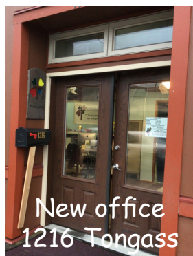
New office 1216 Tongass

Thanks to all TFCU and their members who donated to the Cash for Cans program. You raised $895.00 which will help keep our food pantry full this winter.