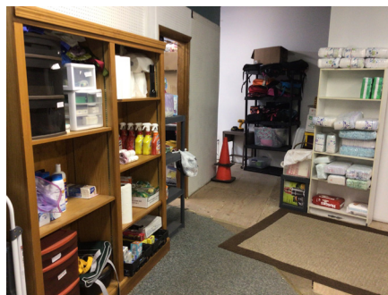
Toiletries/household items/ diapers