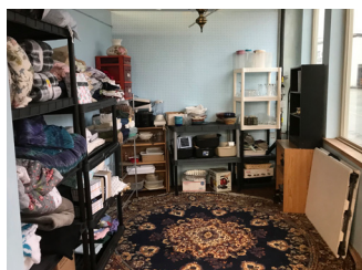
Kitchen & Linen